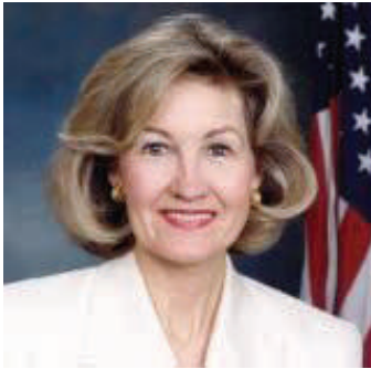
Kay Bailey Hutchinson (R) U.S. Senator