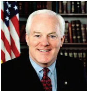
John Cornyn (R) U.S. Senator

10440 N. Central Expressway Suite 1160 Dallas, Texas 75231 Phone: (214) 3613500 Fax: (214) 361-3502