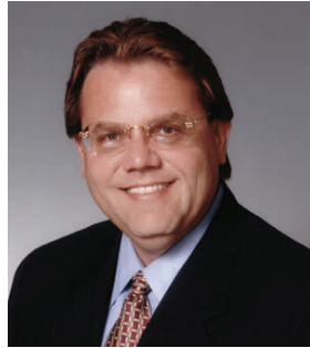
Herbert A. Gears City of Irving Mayor

City of Irving 825 W. Irving Blvd. Irving, Texas 75060 Phone: (972) 721-2410 mayor@cityofirving.org