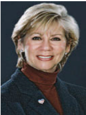
Florence Shapiro (R) Texas Senator

Office of the Governor P.O. Box 12428 Austin, Texas 78711-2428 Phone: (512) 463-2000 Fax: (512) 463-1849