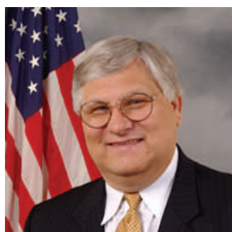
Kenny Marchant (R) U.S. Congressman

Park Central VII 12750 Merit Drive, Suite 1434 Dallas, Texas 75251-1229 Phone: (972) 392-0505 Fax: (972) 392-0615