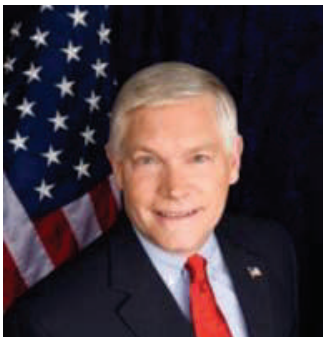
Pete Sessions (R) U.S. Congressman

5001 Spring Valley Road Suite 1125E Dallas, Texas 75244 Phone: (972) 239-1310 Fax: (972) 239-2110