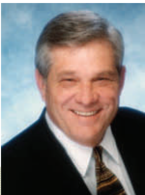
Chris Harris (R) Texas Senator

District Office 5000 Legacy Drive, Suite 494 Plano, Texas 75024 Phone: (972) 403-3404 Fax: (972) 403-3405