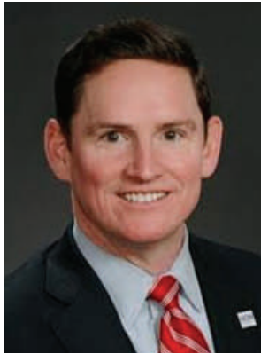
Clay Jenkins Dallas County Judge